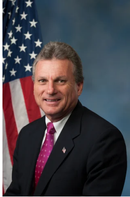
U.S. Rep. Buddy Carter (R-GA), Chairman of the Committee on Energy & Commerce Subcommittee on Health