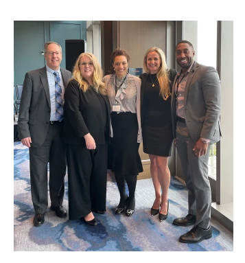
Dear ACH Members.

Wow! What a fantastic week in Washington, DC for our <u>3rd Annual Member Meeting</u> this month! It was wonderful seeing so many of you in person. I was so pleased with the richness of discussions that happened during the meeting and I could not be more proud or grateful to our incredible members who drive our vision, our priorities, and our advocacy. If you have any ideas on how we can improve future meetings, please let us know.